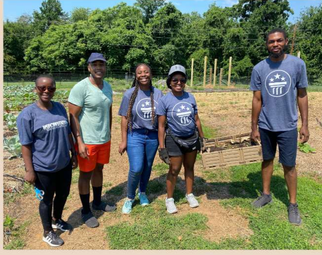
The current cohort of Mandela Washington Fellows from Presidential Precinct volunteer in the CATEC garden