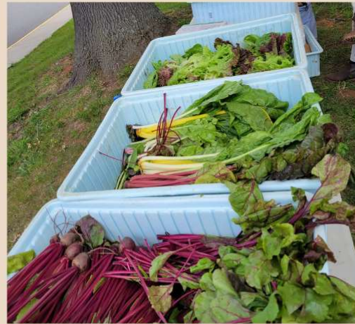
Chillin' in the bed of the truck; friends with Ira Wallace at 6th Street; fresh produce at Community Market Day; staying protected from the sun while working