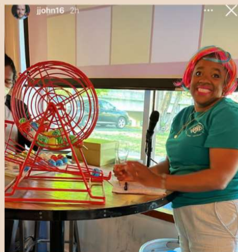
Players, winners, and staff at Cultivate Charlottesville night at Random Row Dab for Good BINGO