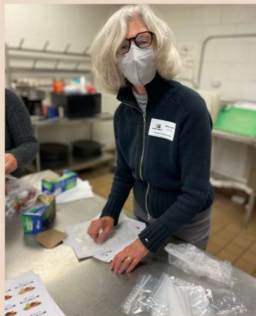
Volunteers and Cultivate staff prepare bags of local, fresh strawberries for March Harvest of the Month