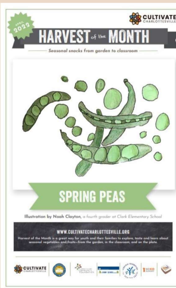
Clark Elementary student Noah waters the raised beds at school; Noah's pea illustration is the focal point of the April Harvest of the Month poster & backpack flyer