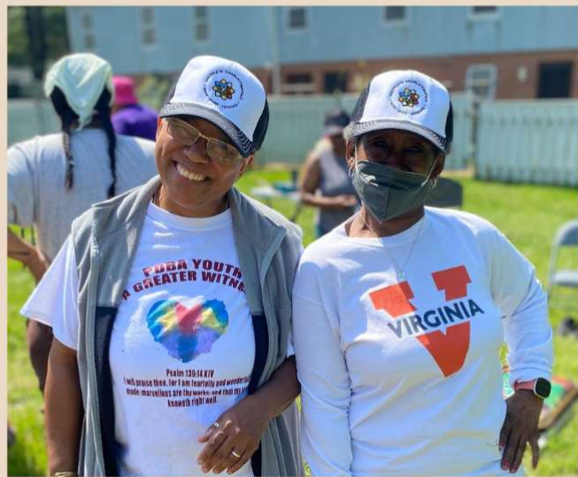
Staff from The Women's Initiative & Cultivate plant with Sister Circle attendees at the 6th Street farm plot